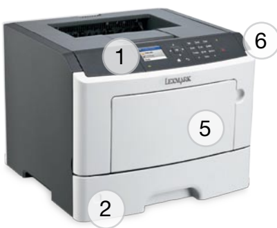
M1145 with 6-cm (2.4-inch) LCD screen

The front USB port allows for convenient walk-up preview, and printing and is compatible with most printable image file formats.