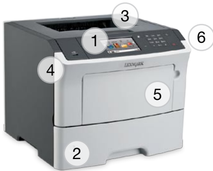
M3150 with 10.9-cm (4.3-inch) colour touch screen